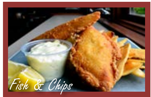
Fish & Chips

All sandwiches and entrees come with our fries otherwise you can substitute for onion rings 2, side salad 3, cheeseballs, jalapeño poppers, or mushrooms 5